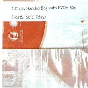
Fig. 1 Cross Handle Bag (LLDPE with EVOH) 50u (Test 5 ; In Oven 50°C 7day)