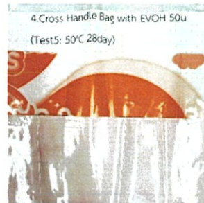
Fig. 4 Cross Handle Bag (LLDPE with EVOH) 50u (Test 5 ; In Oven 50°C 28day)